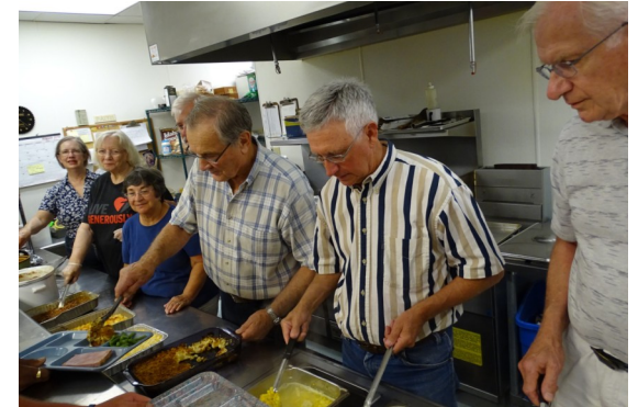
Serving at Christian Care